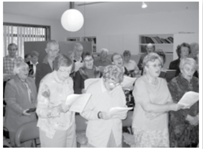
"He that hath God his guardian made" Hymn 99