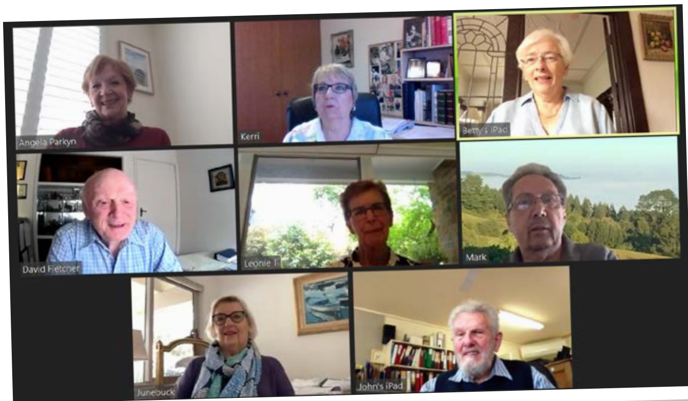
This year's AGM via Zoom with all the Board - A very different look for the event!

permanent and short- term guests who, in an emergency, can use the stairs for exit.