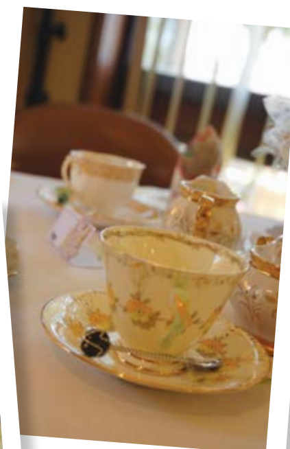
Residents of the units put on a splendid afternoon tea in February