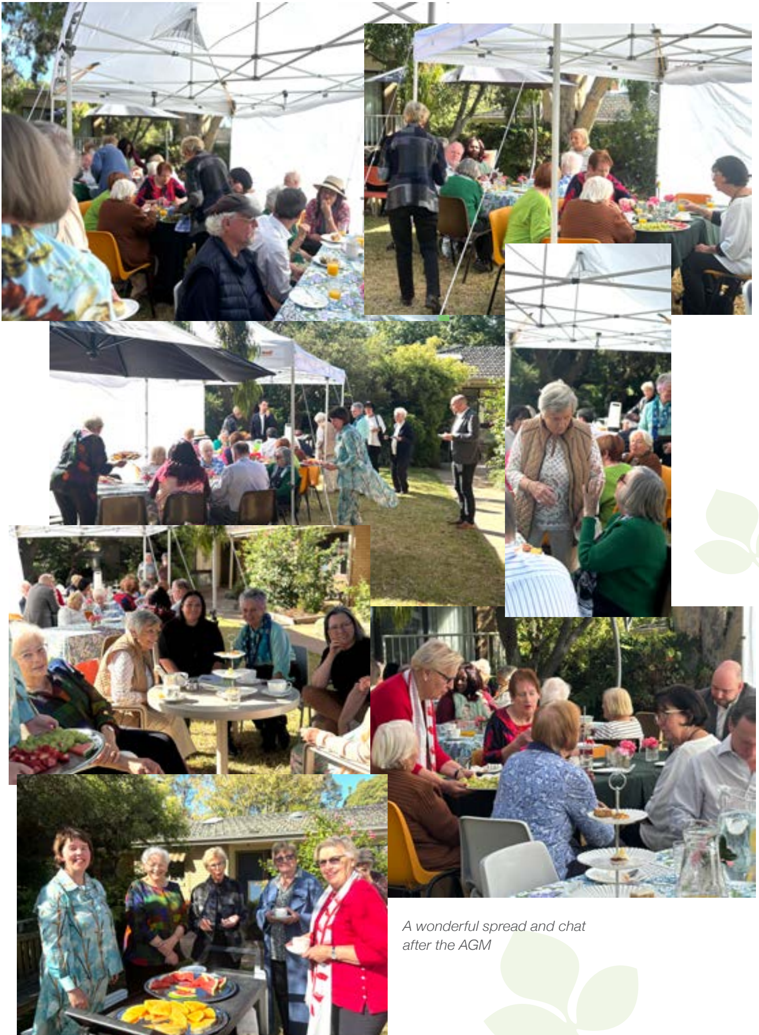
A wonderful spread and chat after the AGM