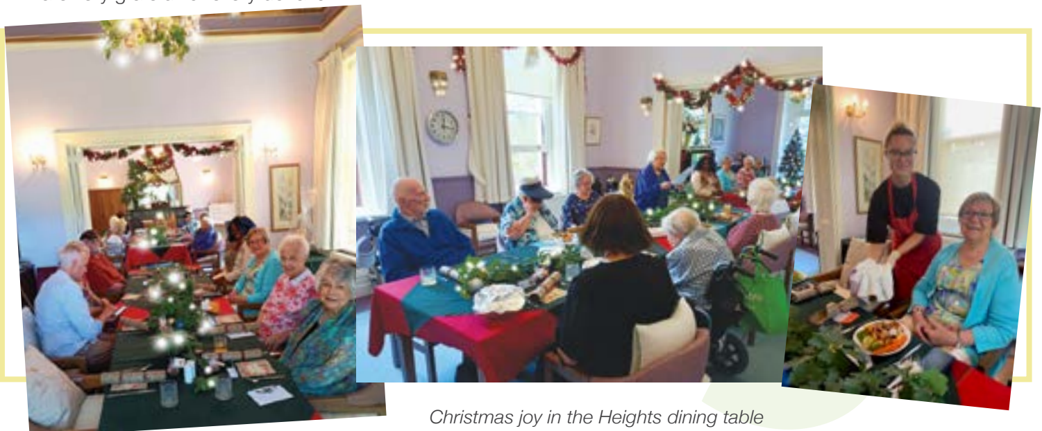
Christmas joy in the Heights dining table