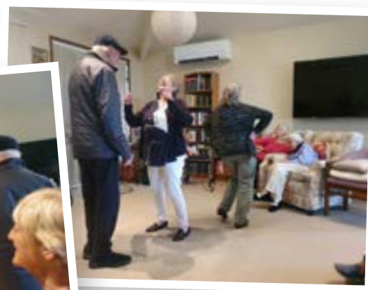
A new activity - Dance time!